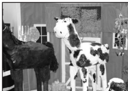
Exhibit at the Elementary Art Show

Warren Township recognizes the impact The Arts has on a student and continues to offer many opportunities for students to explore and experience.