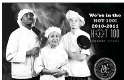
Walker Career Center's Threshold is in the Top 100 in the nation!

Warren Central High School's Lady Warriors named Sectional Champs.